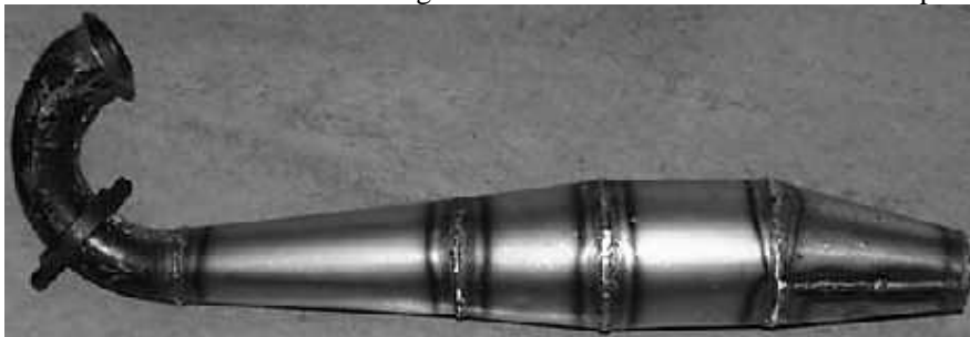
XP-exhaust system with the short asymmetrical reverse cone

To avoid these collisions there is also a second asymmetrical reverse cone that has one side that is parallel with the straight pipe. This reverse cone should allow the system to be fitted without risk of interference with the wheelhouse and the straight sidewall makes it easier to fit the adapter for your 2" pipe.